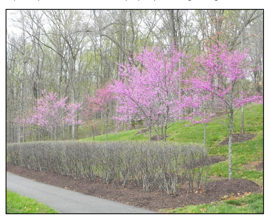
This portion of the Landscape features winterberry, redbud, and red oak.

In accordance with the JTHG's Master Landscape Plan, the planting utilized "red" trees – redbud, red maple, and red oak – to symbolize the soldiers' courage and bravery. Surrounding landscape elements, including red twig dogwood and winterberry, ensure that natural red hues are present on the frontage through every season, serving as a constant reminder of the sacrifice made by 71 soldiers among 620,000.