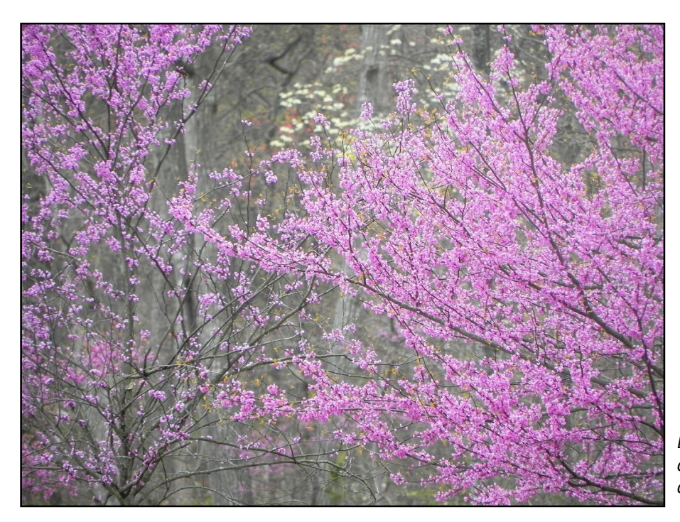
Left: layers of redbud blossoms create an elegant backdrop for contemplation and commemoration.